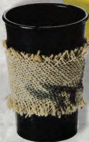
Original Green Cup

"Community Travel Guide" is a guidebook that allows encounters with people who live the unique Fukui life. By including 392 local Fukui people, the book proposes a new style of trip, which not only obtains deep knowledge and experiences, but also makes bonds with people.