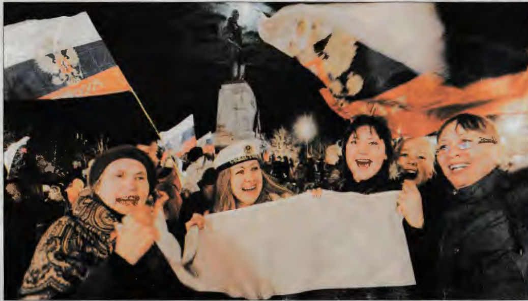
Pro-Russian Crimeans celebrate in Sevastopol on Sunday.